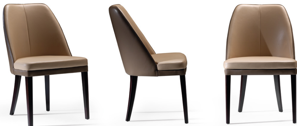
chair 55x59 h 86 / Outside frame Leather art. LIKE col. 13. Inside frame and seat cushion leather art. LIKE col. 09. Thread col. 8362. Wood finishing Wengè mat.