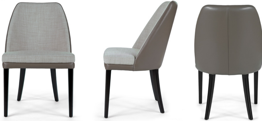
chair 55x59 h 86 / Outside frame leather art. LIKE col. 13. Inside frame and seat cushion fabric art. SORBARA col. 160. Thread col. 8362. Wood finishing Wengè mat.