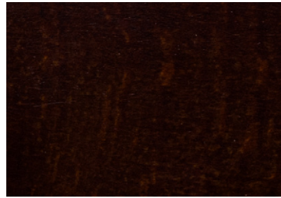
base in legno wooden base base en bois Holzbasis