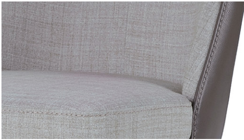
filo tono su tono thread tone on tone fil ton sur ton Ton-in-Ton-Nähgarn